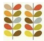
Orla Kiely (1963-)